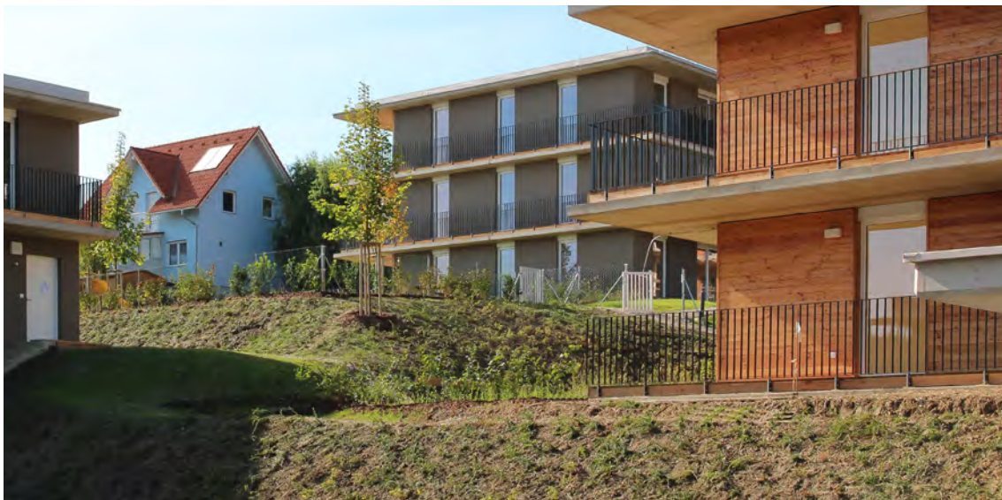
Housing Construction Hausmannstätten (2012)