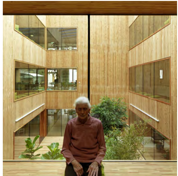
Retirement Home Maria Gail (2010)