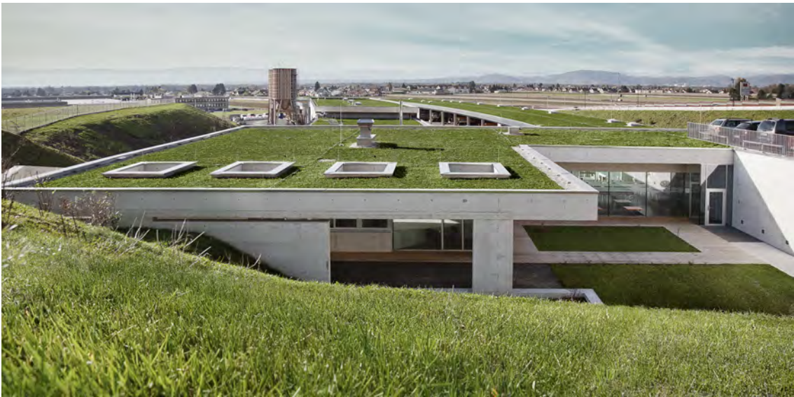
Hausmannstätten Bypass Road Hausmannstätten (2012)