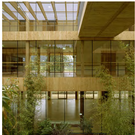
Retirement and Nursing Home Steinfeld (2005)