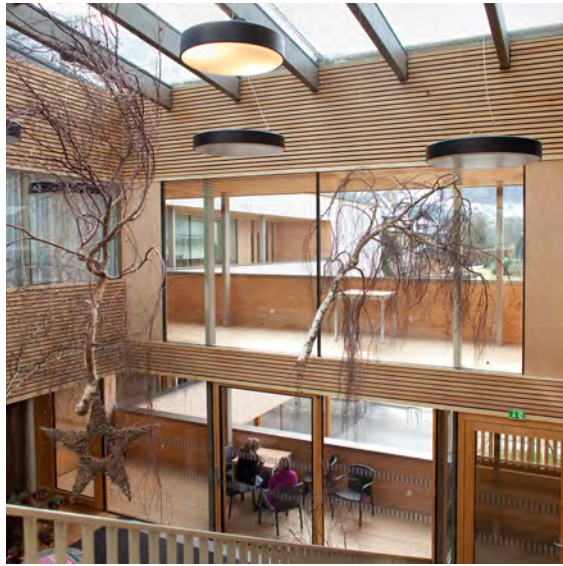
Retirement Home Nenzing (2013)