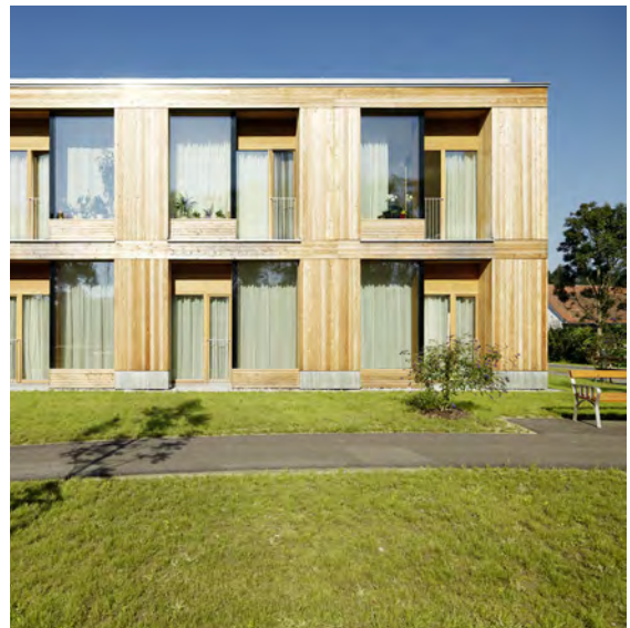
Residential Care Home Erika Horn (2015)