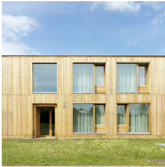
Peter Rosegger Nursing Home Graz (2014)