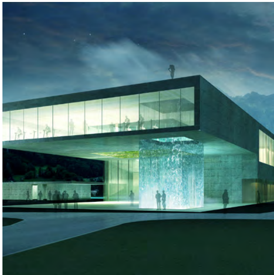
top left: Health Care Facility St. Vinzenz Schwarzach/Pongau (2013)