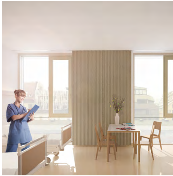
Hospital Barmherzige Brüder Graz (2014) construction in progress