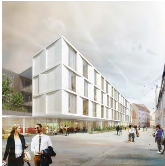
top left: Health Care Facility Josefhof (2014, construction in progress)