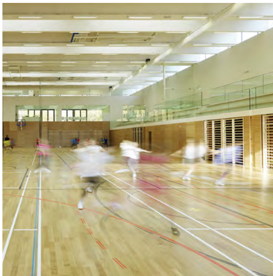
Sports Hall St. Martin Villach (2013)