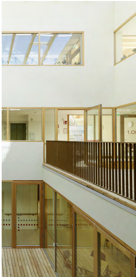
Nursing Home Leoben (2014)