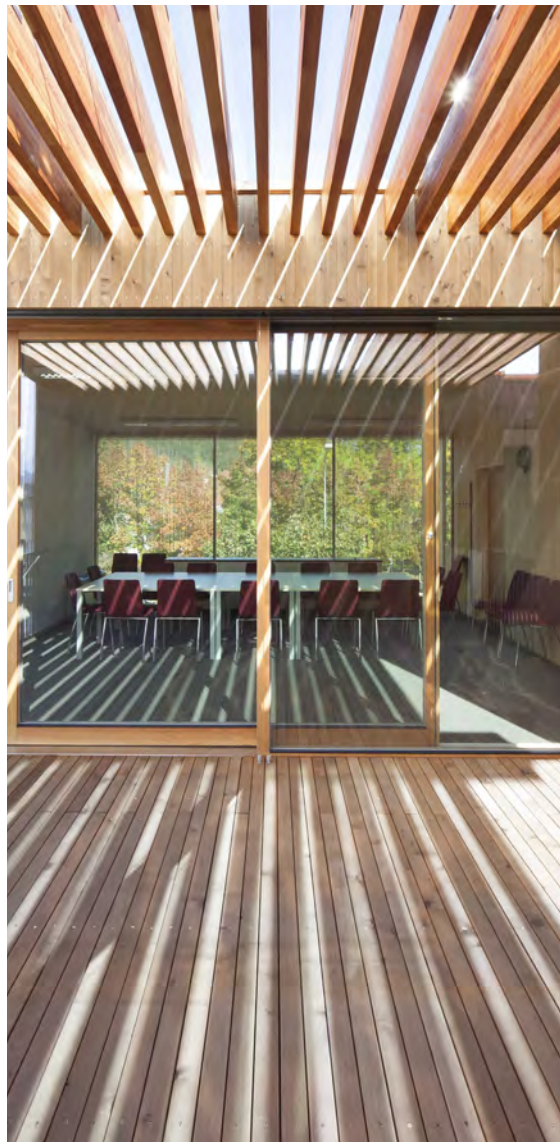
Sparkasse Bank in Waidmannsdorf Klagenfurt (2014)