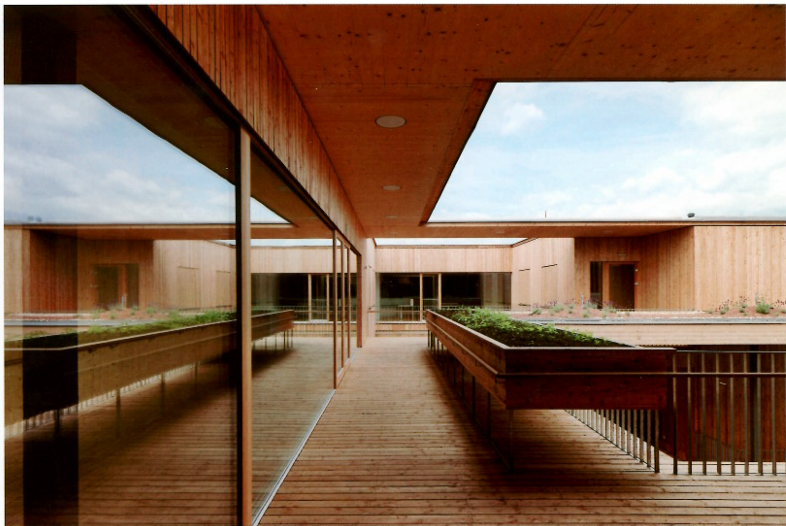
项目位置：奥地利格拉茨市 设计师：Dietger Wissounig Architekten